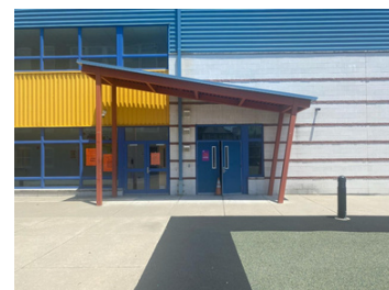
Pick Up for All: Gym Door