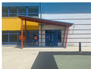
Groups 5-7 Gym Door by parking lot