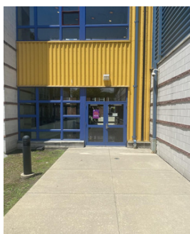
Groups 1-4 courtyard entrance